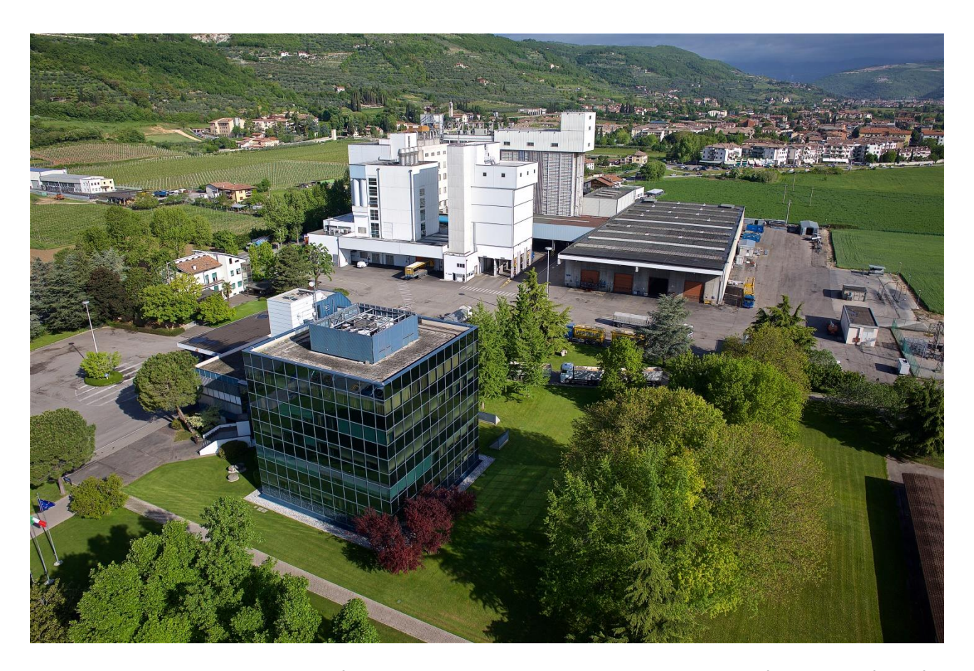
Picture 1: Verona, Headquarter of Veronesi Group and the production plant of extruded feed for aquaculture